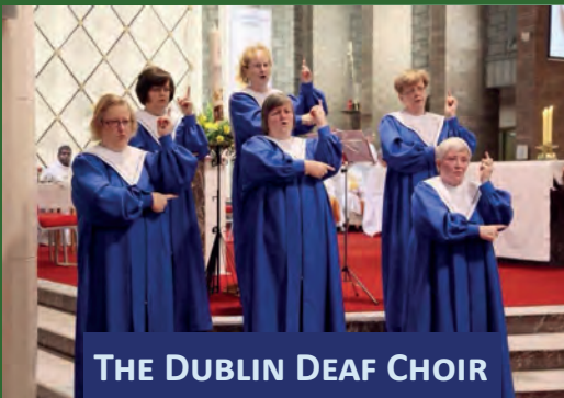
THE DUBLIN DEAF CHOIR